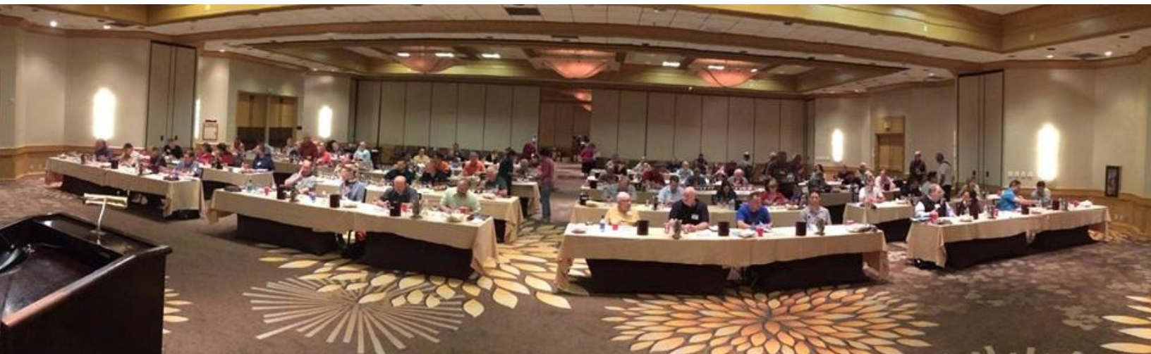
Judges at the 2015 Commercial Wine Competition

Barefoot Bubbly, NV Sparkling Wine, Moscato Spumante Champagne, California, Charmat Method