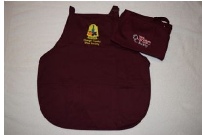
Aprons Traditional or New Logo $22 Name Embroidery $5 Extra