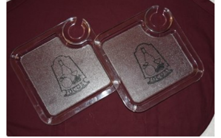
OCWS Logo Trays $3 or 2 for $5