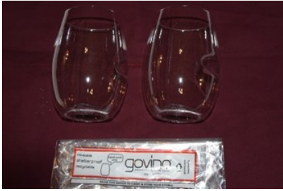
Govino Glasses $3 or 2 for $5