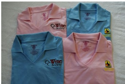
Ladies Collared Short Sleeve Shirts Traditional or New Logo Small to XL $25