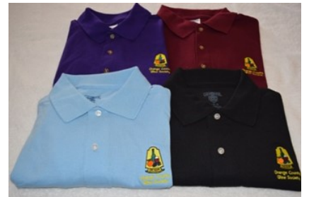
Polo Shirts for Men or Women Traditional or New Logo Small to 2XL $25