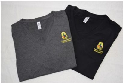
¾ Sleeve Ladies T-Shirts Traditional Logo, Small to XL $30