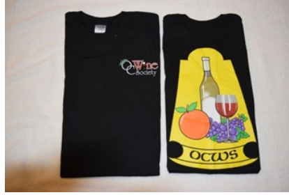
T-Shirts Printed on Both Sides $20