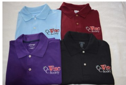
Polo Shirts for Men or Women Traditional or New Logo Small to 2XL $25