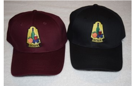
OCWS Hats Traditional Logo $10