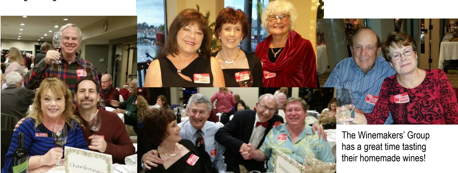
The Winemakers' Group has a great time tasting their homemade wines!