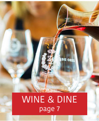
WINE & DINE page 7