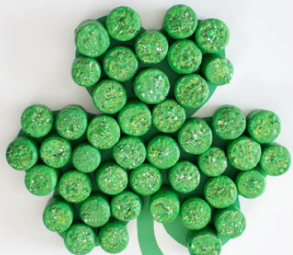
FROM FRAN page 2