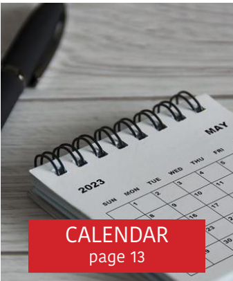
CALENDAR page 13