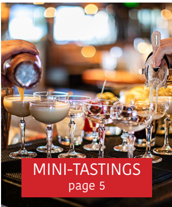
MINI-TASTINGS page 5