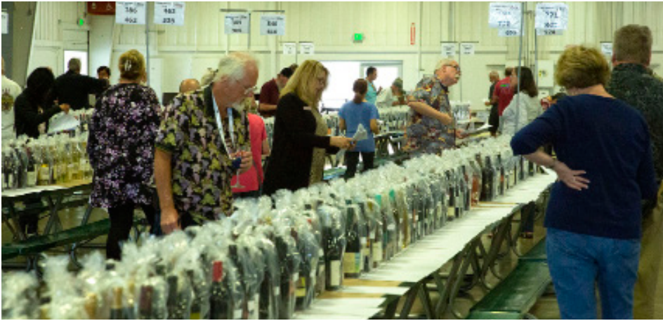
OCWS members attend the annual wine auction featuring more than 4,400 wines in search of good deals and fun times.