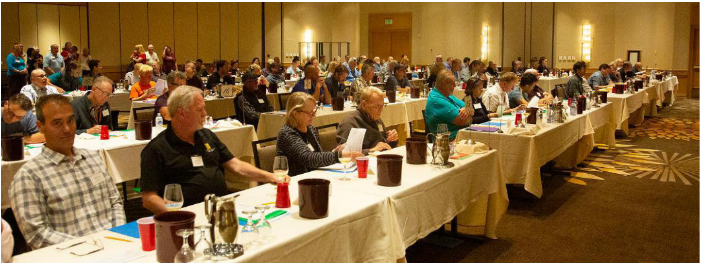
Volunteers and judges make the OCWS Commercial Competition a success each and every year.